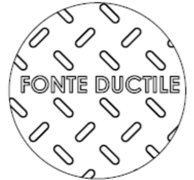
H (1 : 5)