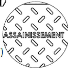
I (1 : 7)